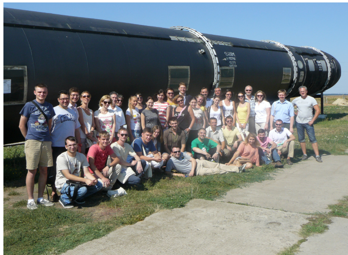
Participants of the Odessa summer school with SS-18 in the background.

On August 18-23, Odessa National I.I. Mechnikov University, in cooperation with the Swedish Radiation Safety Authority, conducted its 4th international nonproliferation summer school for students and young professionals. This year's school theme was "Global Nuclear and Missile Proliferation and Its Impact on Ukraine." The school audience included 32 participants from Ukraine, Georgia, Russia, and Moldova. In addition to Ukrainian experts, school organizers engaged a diverse group of international experts including representatives from Vienna Center for Disarmament and Non-Proliferation, SIPRI, and the Comprehensive Test Ban Treaty Organization. The school was aimed at drawing ongoing attention of Ukrainian students to the missile and nonproliferation problems and their impact on Ukraine as a state, which possess a significant missile and space industry. The programme of the school included lectures by experts, presentations by selected participants and a roundtable discussion. One of the school's program highlights included a visit to the Museum of the Strategic Nuclear Forces of the Soviet Union in the town of Pervomaysk.