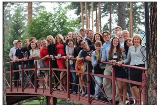
Participants of the VII International Summer School in Tomsk, Russia.