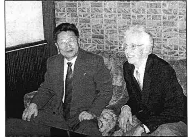
Nov. 2006 Pyongyang