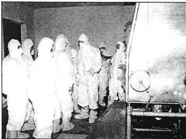
August 9, 2007, Yongbyon