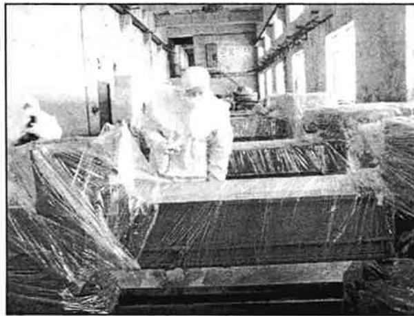
Feb. 14, 2008, Yongbyon