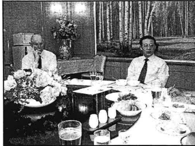
Aug. 2005 Pyongyang