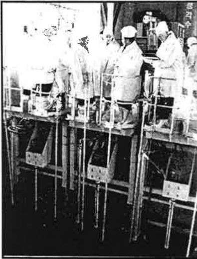
Jan. 2004 Yongbyon