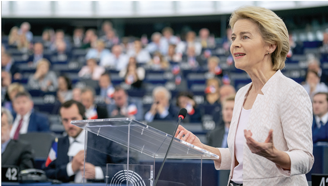
Ursula von der Leyen, President of the European Commission

Beyond that, Europe has become interested in, and worried about, China's geopolitical ambitions. The European Union's External Action Service, for instance, said the following: "For the EU, Taiwan is a reliable and valued like-minded partner in Asia. The EU and Taiwan share common values, such as democracy, the rule of law, and human rights. We are both committed to upholding multilateralism and the rules-based international order." 68 Growing rapprochement between China and Russia has also raised red flags. EU High Representative for Foreign Affairs and Security Policy Josep Borrell called the China-Russia Joint Statement issued before Russia's invasion of Ukraine "an act of defiance" by countries that had written a "revisionist manifesto." 69 China's embrace of Russia despite, or because of, the invasion has strengthened that sentiment.