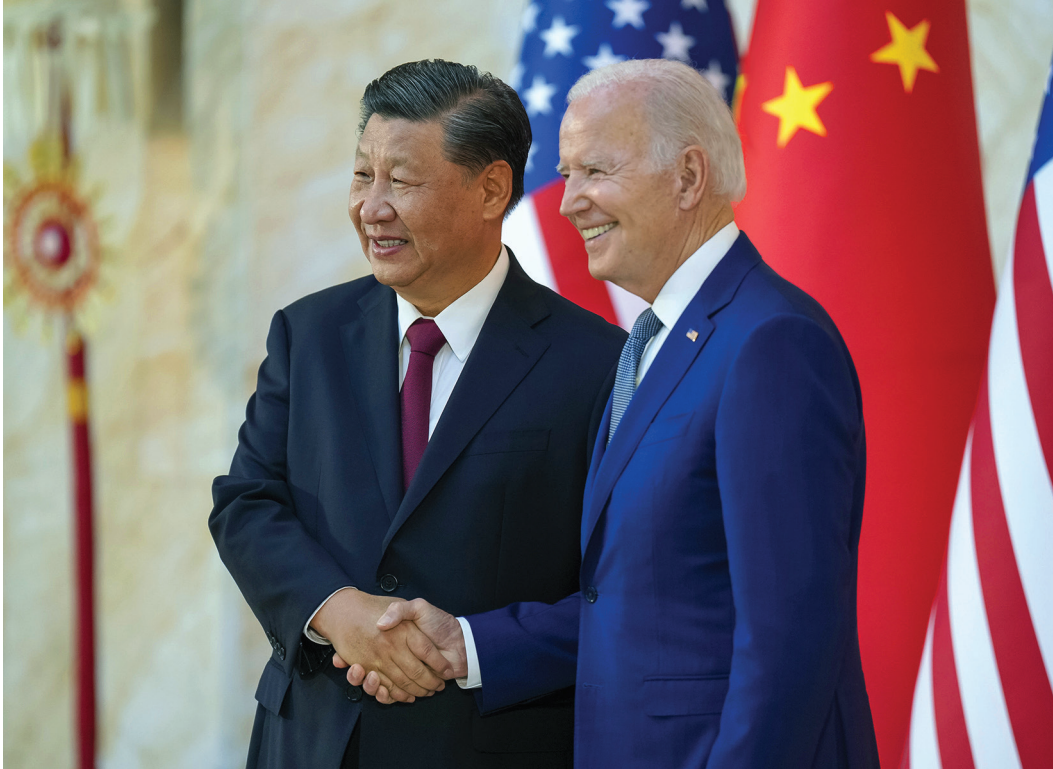
President Joe Biden and Chinese President Xi Jinping

But it would be wrong to assume that China’s nuclear build-up does not impact Europe, or that it does not impact it greatly. On at least two accounts, the build-up and its consequences directly affect European countries.