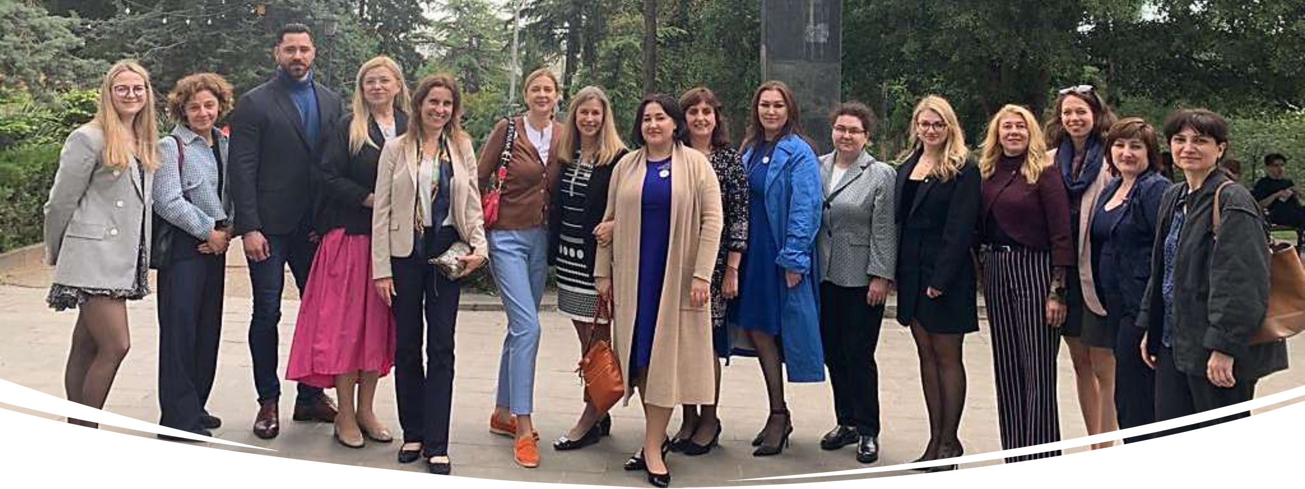
First BSWN Leadership meeting May 8-10 , 2023, Tbilisi Georgia