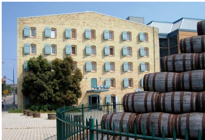
CIGI is located in the historic former Seagram Museum in Waterloo, Ontario, Canada.

Le CIGI a été fondé en 2002 par Jim Balsillie, co-chef de la direction de RIM (Research In Motion). Il collabore avec de nombreux partenaires stratégiques et exprime sa reconnaissance du soutien reçu de ceux-ci, notamment de l'appui reçu du gouvernement du Canada et de celui du gouvernement de l'Ontario. Le CIGI exprime sa reconnaissance envers le gouvernement du Canada pour sa contribution à son Fonds de dotation.