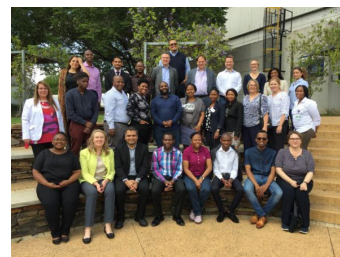
Intensive short course participants

In continuing and expanding its training programs for diplomats and practitioners in nuclear nonproliferation and disarmament issues, CNS partnered this year with the South African government to offer a one-week intensive course in Pretoria from November 5-9, 2018.