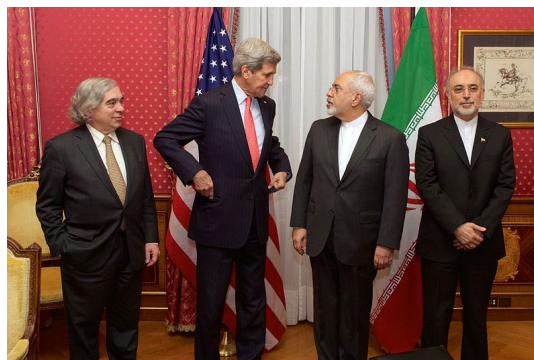
The chief US and Iranian negotiators, 2015.

*Experts speak to the media in their own capacity and do not reflect the views of CNS.