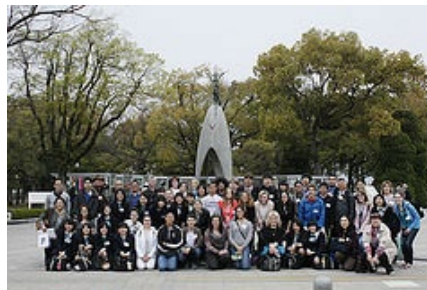
CIF participants in front of the Hiroshima Children's Peace Monument

This was the first time in the eighteen-year history of the CIF that the student conference was held in Hiroshima, the first city to have ever experienced nuclear devastation, in commemoration of the seventieth anniversary of the 1945 atomic bombings of Hiroshima and Nagasaki.