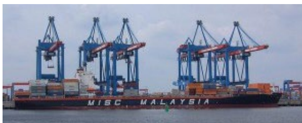
Malaysian Vessel at Container Terminal, Source: Wolfgang Meinhart, CC BY-SA 3.0 via Wikimedia Commons

Under a grant from the Naval Postgraduate School's Project on Advanced Systems and Concepts For Countering WMD, CNS is examining the growing industrial and high-tech manufacturing capabilities in Southeast Asia and how, over the next decade, that growth may challenge global efforts to control the flow of dual-use technologies related to the development of weapons of mass destruction (WMD).