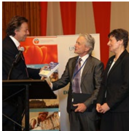
Dutch Foreign Minister Bert Koenders welcomes UN Messenger of Peace Michael Douglas, with UN High Representative Angela Kane

On April 28, 2015, CNS joined Harvard University's Belfer Center, the Netherlands government, and the United Nations Office for Disarmament Affairs in convening nuclear nonproliferation experts from around the world at the United Nations to participate in a symposium on the Treaty on the Non-proliferation of Nuclear Weapons, the NPT.