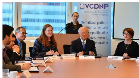
IAEA Director General Yukiyo Amano at the event on Amendment to the Convention on the Physical Protection of Nuclear Material hosted by the Vienna Centre for Disarmament and Non-Proliferation.