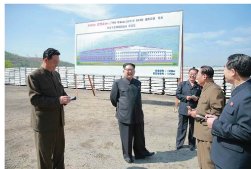
Kim poses at the construction site of a modernized steel casting workshop.