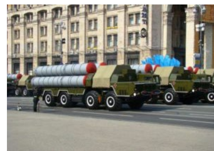
Ukraine S-300 SAM during the Independence Day parade in Kiev, 2008

While Ukraine's denuclearization is often treated as a foregone conclusion today, this outcome at the time was far from guaranteed. Close cooperation between the United States and Russia was fundamental to persuading Ukraine to give up its vast nuclear inheritance.