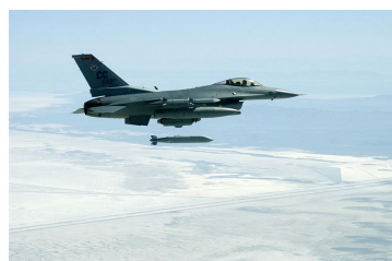
An F-16C Fighting Falcon releases an AGM-154 Joint Stand-off Weapon over the Utah Test and Training Range.

In a new story published by the National Interest , Senior Fellow Nikolai Sokov discusses how Russia's acquisition of precision-guided long-range conventional strike weapons--with India's and China's to likely follow--is changing the strategic landscape in a fundamental way.