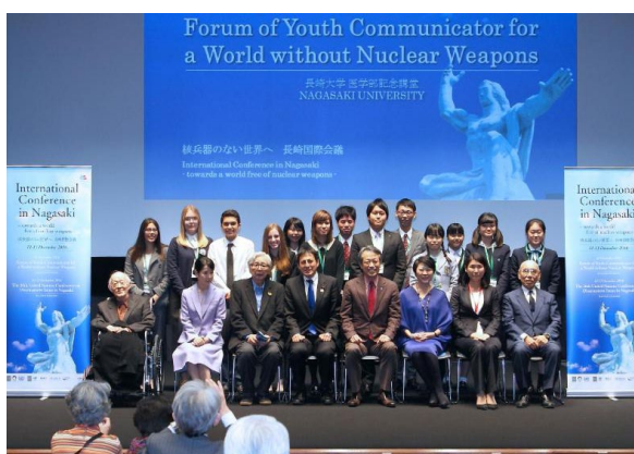
Youth Forum Participants

Last month, CNS Critical Issues Forum students participated in the "Forum of Youth Communicators for a World without Nuclear Weapons" in Nagasaki, Japan. The Japanese Ministry of Foreign Affairs, Nagasaki University, and the United Nations Regional Center for Peace and Disarmament in Asia and the Pacific coordinated the event. Students collaborated to create and present recommendations for achieving a nuclear-free world before submitting them to United Nations Under-Secretary-General and High Representative for Disarmament Affairs Kim Won-soo.