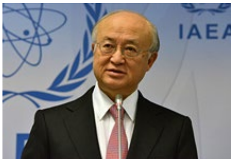
IAEA Director General Yukiya Amano briefs international press and media during the November