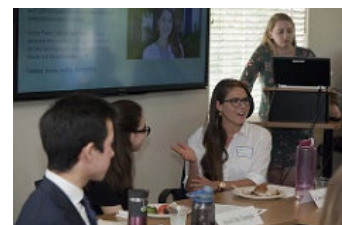
Summer 2018 undergraduate interns present their research

CNS is pleased to accept applications for its undergraduate internship program. This is a unique opportunity for undergraduate students to receive on-the-job training and conduct independent research on issues related to the spread and control of weapons of mass destruction under the guidance of senior CNS faculty.