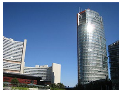
VCDNP is located in the Andromeda Tower

Titled "Behind Closed Doors," the article looks at how the Center provides a much-needed "safe space for diplomacy on nuclear issues," a role that is critically important to mitigate the fallout from arms control setbacks such as the US withdrawal from the Intermediate-range Nuclear Forces Treaty, its withdrawal from the Iran