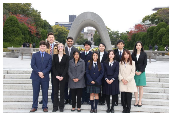
Youth Communicators in front of Cenotapho for A-bomb victims at the Hiroshima Peace Park

The forum kicked off a week of high-level nuclear disarmament-related meetings organized by the United Nations.