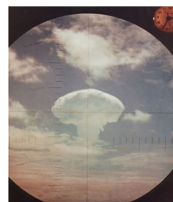
The Frigate Bird test was the only US operational ballistic missile launch with a live warhead, an experiment that North Korea threatened to repeat.

"And part of the reason is that he seems to have found the perfect foil in this American President, who speaks loudly, spitting invective at Kim with regular frequency, and carries a stick of yet-to-be-determined size."