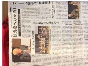
Coverage of the CIF in Nagasaki Shimbun.

Role for a World Free of Nuclear Weapons," is particularly timely as 2016 marks the twentieth anniversary of the treaty's opening for signature.