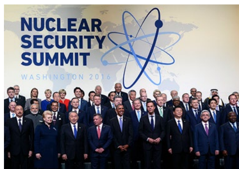
Nuclear Security Summit

Keep up with the prolific publications of CNS staff in Monterey, Washington, and Vienna by following us on Twitter and Facebook .