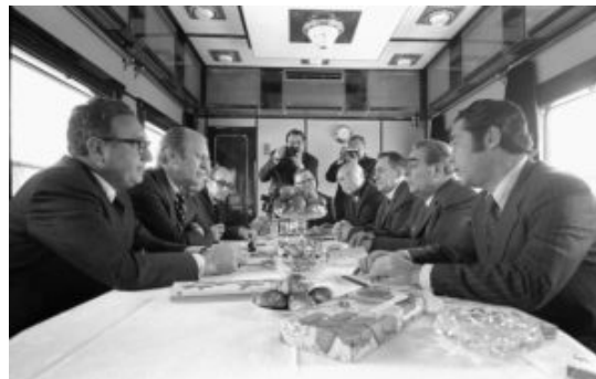
US and Russian negotiating teams headed by Gerald Ford and Leonid Brezhnev, respectively, circa 1974.