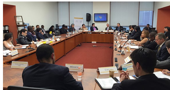
Panelists and participants in the Summer School in Mexico Discuss the Nonprospects for nuclear disarmament