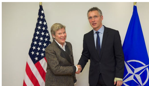
NATO Secretary General Jens Stoltenberg appoints Rose Gottemoeller as the next Deputy Secretary General, as of October 1, 2016

The Nonproliferation Review , CNS's refereed journal, will be hosting an event in our Washington, DC, office, Monday, September 12 , to launch the newest issue: a special, double issue focusing on efforts to eliminate weapons of mass destruction, such as those that took place in Syria, Iraq, South Africa, Libya, and elsewhere, with a view to imparting lessons for future WMD elimination contingencies, such as what may be required in North Korea.