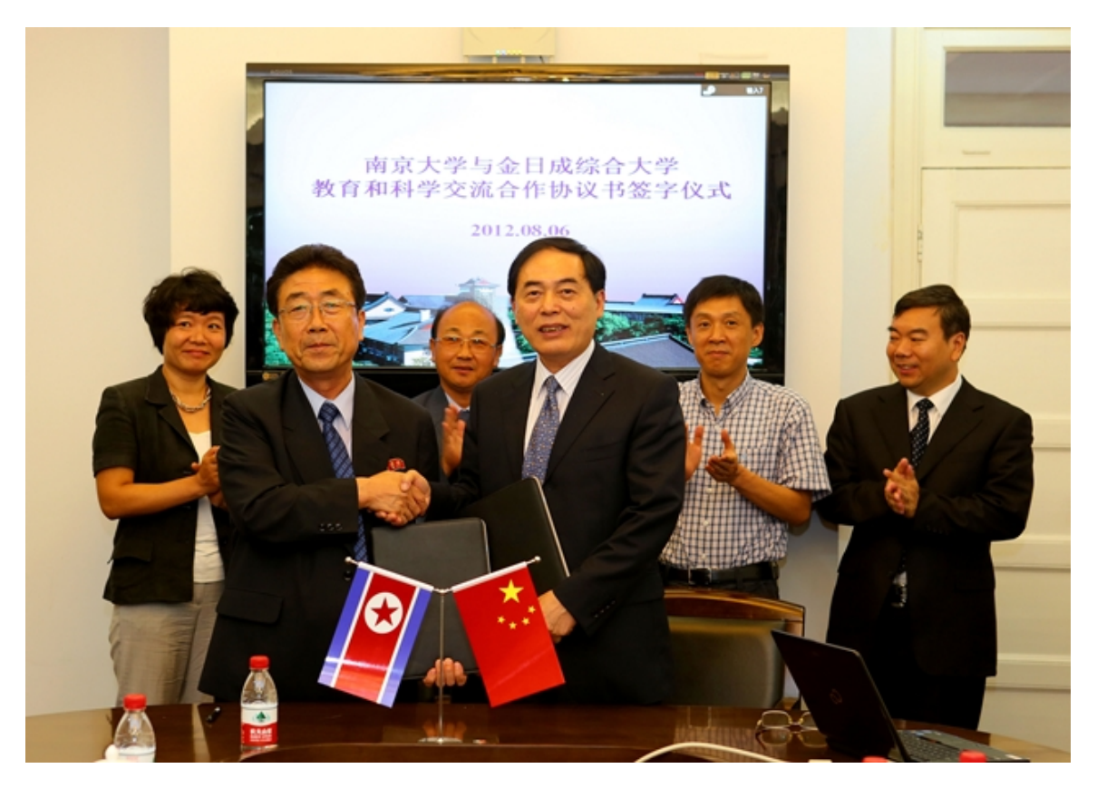
North Korean and Chinese university presidents after signing a cooperation agreement, August 6, 2012.

Hosting international conferences. According to the official North Korean news media, KISU has played host to a series of "international academic symposia," as well as a "joint scientific conference" with Eurasia-Pacific Uninet in August 2012 on the theme of "Biomedical and Biotechnological Progress for a Healthy Society."<sup>50</sup>