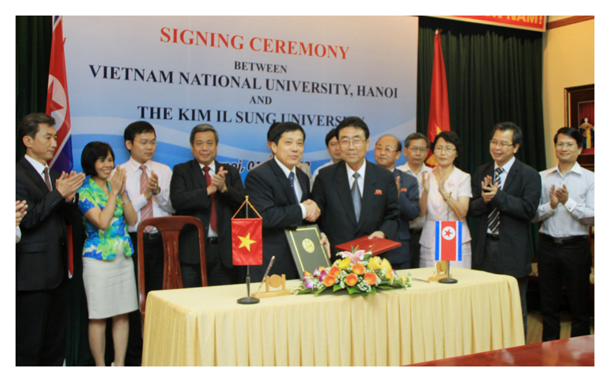
Vietnamese and North Korean university presidents after signing a cooperation agreement, August 1, 2012.

between KISU and a Russian university, following Moscow State University and the Far Eastern Federal University (FEFU) in Vladivostok.<sup>46</sup>