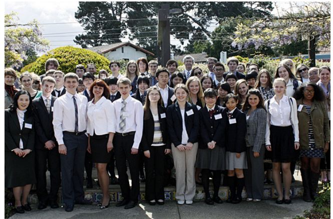
Students and teachers from Japan and Russia joined their peers from the US at the 2014 spring conference of the Critical Issues Forum – a nonproliferation and disarmament educational outreach project for high school students – convened by the James Martin Center for Nonproliferation Studies on April 4th and 5th at Santa Catalina School in Monterey.

In April, students arrived from five US high schools: (California, Connecticut, Maine, Massachusetts, and Wisconsin), four Russian high schools in closed nuclear cities (Lesnoy, Novouralsk, Ozersk and Zelenogorsk), and six Japanese schools from Hiroshima, Nagasaki, Kanagawa and Tokyo presented their findings on the topic "Nuclear Nonproliferation: Global Opportunities and Regional Challenges."