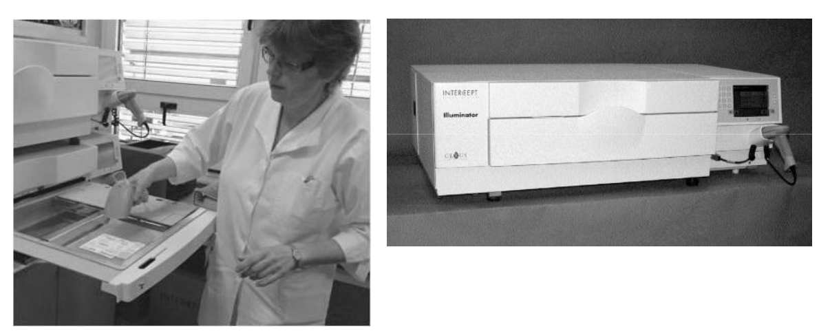
Figure 7: Illuminator for Photochemical Treatment of Blood Products Intercept, CERUS.