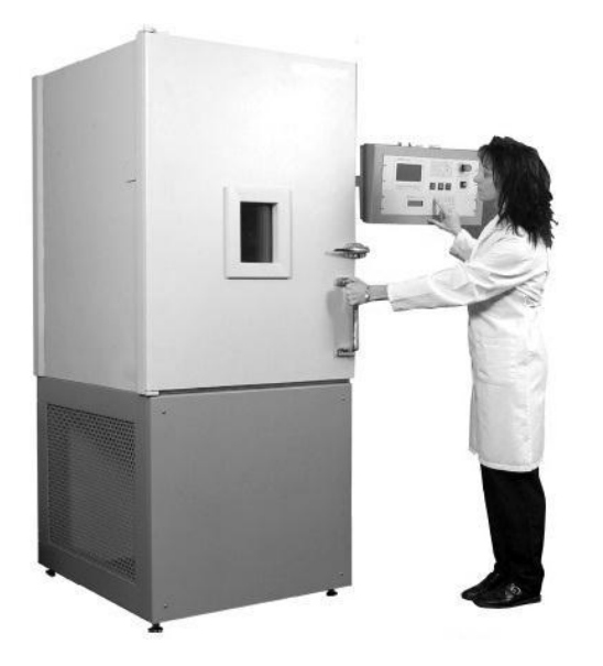
Figure 4: X-ray blood irradiator, Radsource.

Source: U.S. National Academy of Sciences, Committee on Radiation Source Use and Replacement, "Radiation Source Use and Replacement," 2008, p. 88.