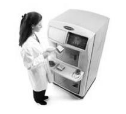
Figure 3: Cs-137 blood irradiator Gammacell, Best Theratronics.