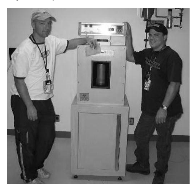
Figure 2: Typical self-shielded Cs-137 blood irradiator.